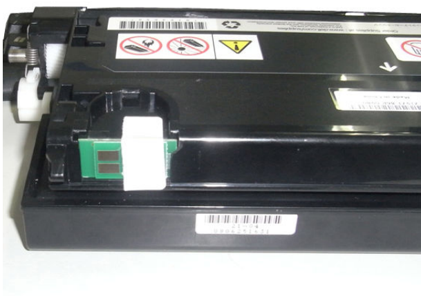
(3) Insert compatible chip with tape to attach the chip to the cartridge. (2 golden contacts should NOT be covered as the photo)

For more information, contact us as below: